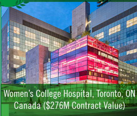
Women's College Hospital, Toronto, ON Canada ($276M Contract Value)