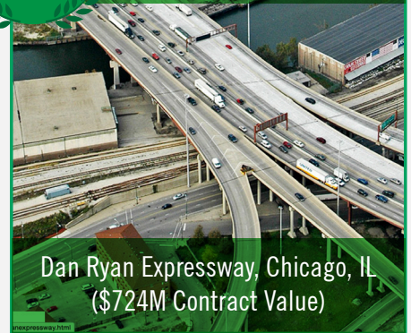
Dan Ryan Expressway, Chicago, IL ($724M Contract Value)