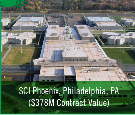
SCI Phoenix, Philadelphia, PA ($378M Contract Value)