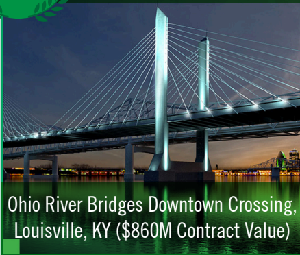
Ohio River Bridges Downtown Crossing, Louisville, KY ($860M Contract Value)