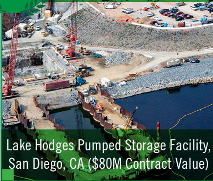
Lake Hodges Pumped Storage Facility, San Diego, CA ($80M Contract Value)