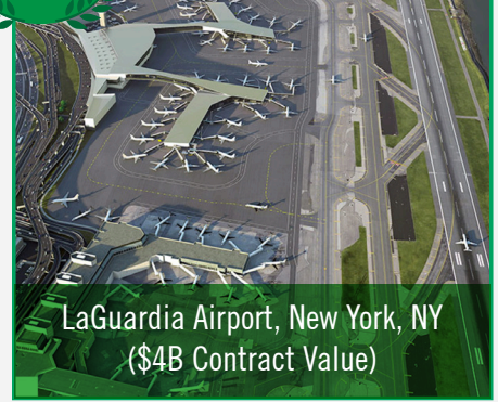
LaGuardia Airport, New York, NY ($4B Contract Value)